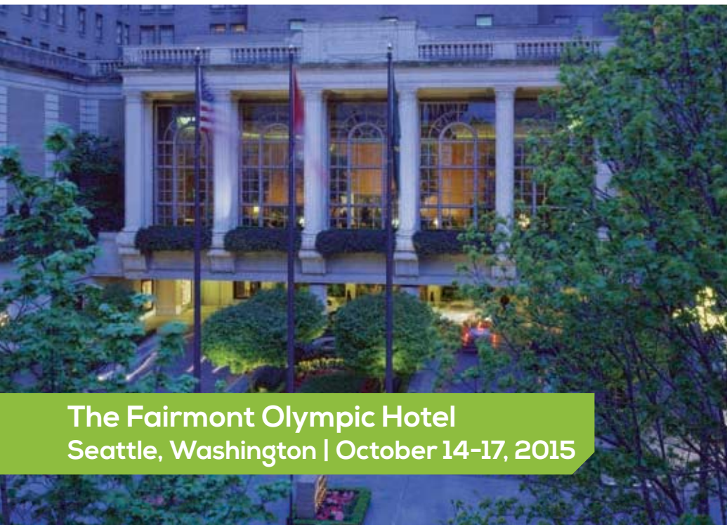
The Fairmont Olympic Hotel Seattle, Washington | October 14-17, 2015

FALL MEETING & LEADERSHIP AND MANAGEMENT IN RADIOLOGY PROGRAM